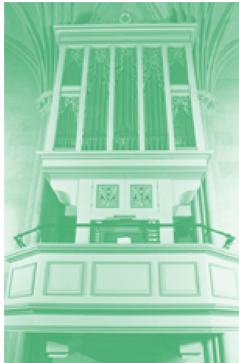
Brombaugh Organ 1997