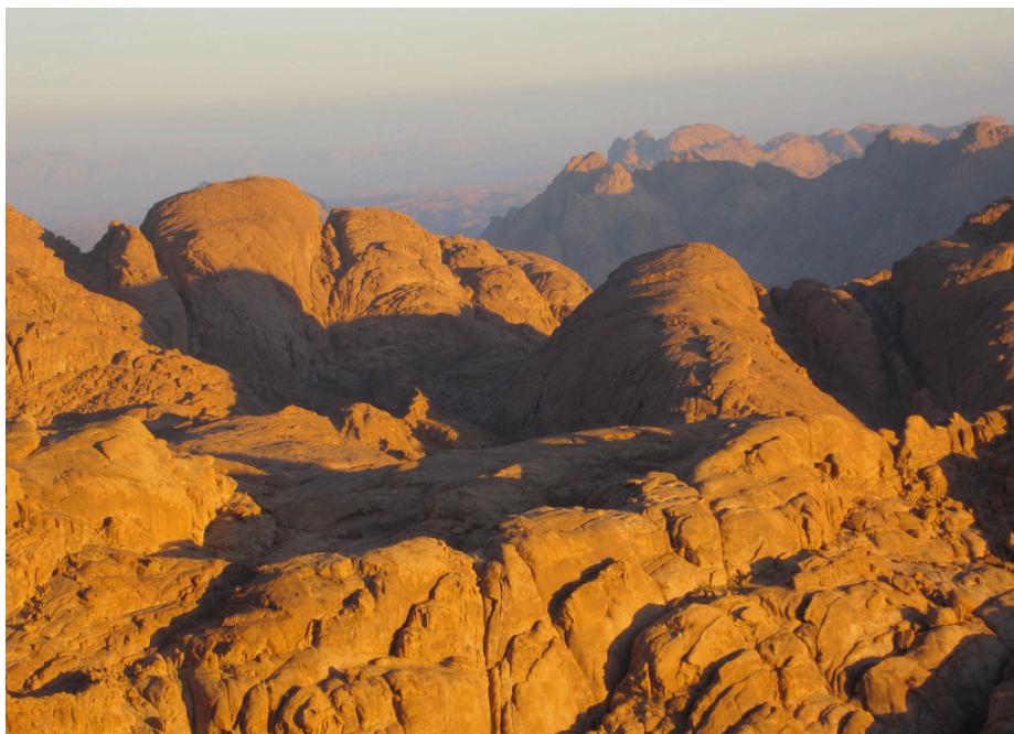
A view from atop Mt. Sinai.

~ Keeping the heart of the University listening to the heart of God ~