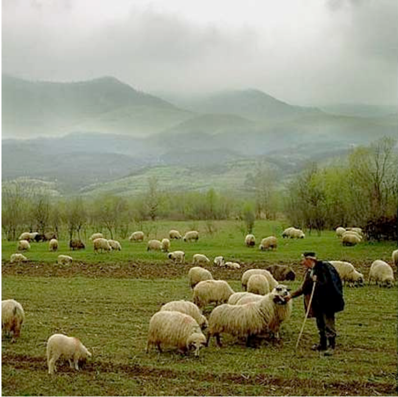
A Shepherd in Romania, 2005.

~ Keeping the heart of the University listening to the heart of God ~