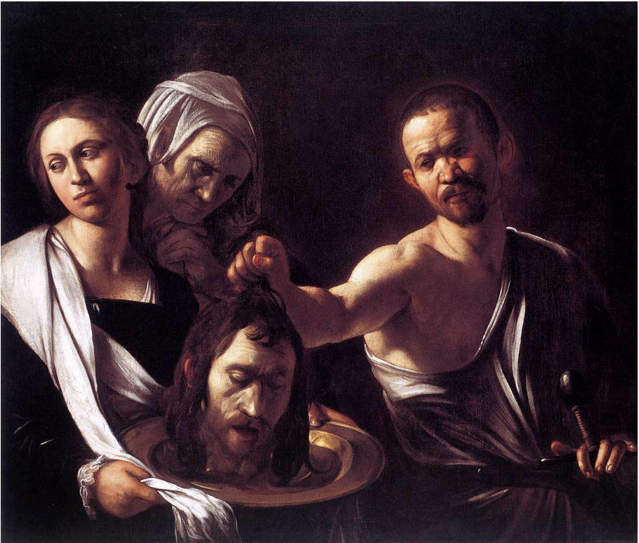
"Salome with the head of St. John the Baptist," by Caravaggio, c. 1607.

∞ Keeping the heart of the University listening to the heart of God ∞