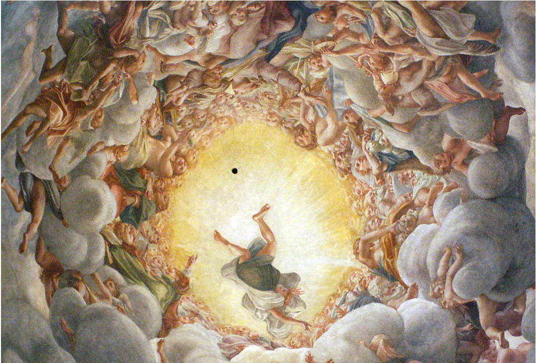
The Assumption of the Virgin, from the dome of the Cathedral of Parma, Italy Antonio da Correggio, 1526–1530

Tonight is the eve of All Saints' Day, the festival in the church that recalls the faith and witness of our brothers and sisters in Christ throughout all ages. The service celebrates the Lord's faithfulness in their lives, and memorializes the recently deceased. The early church followed the Jewish custom that a new day began at sundown; thus, feasts and festivals in the church were observed beginning on the night before. The night before All Saints' (or All Hallows') became known as All Hallows' Eve, or Halloween. Our scripture readings tonight point to Jesus Christ, for it is only by faith in him that we step from darkness into light and from death into life.