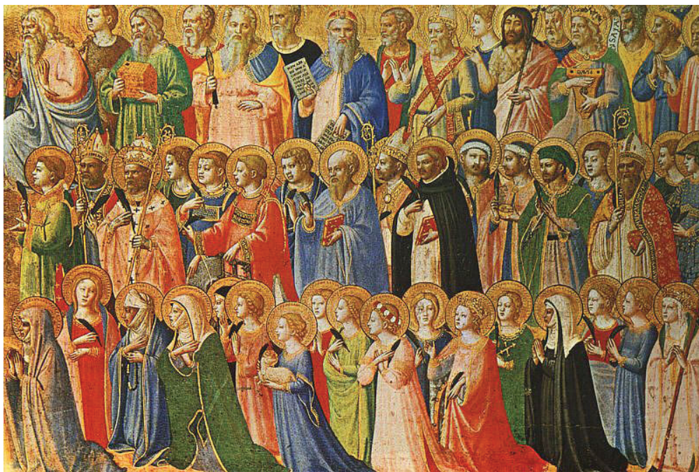
Fra Angelico, The Forerunners of Christ with Saints and Martyrs , early 15th century

Tonight is the eve of All Saints' Day, the festival in the Church that recalls the faith and witness of our siblings in Christ throughout all ages. Tonight's service celebrates our continuing communion with them and memorializes the recently deceased. The early Church followed the Jewish custom that a new day begins at sundown; therefore, the observation of feasts and festivals in the Church still begins the night before. The night before All Saints' (or All Hallows') became known as All Hallows' Eve, or Halloween. While we celebrate and commemorate the faithful departed, our Scripture readings tonight point to Jesus, for it is by faith in him that we step from darkness into light and from death into life.