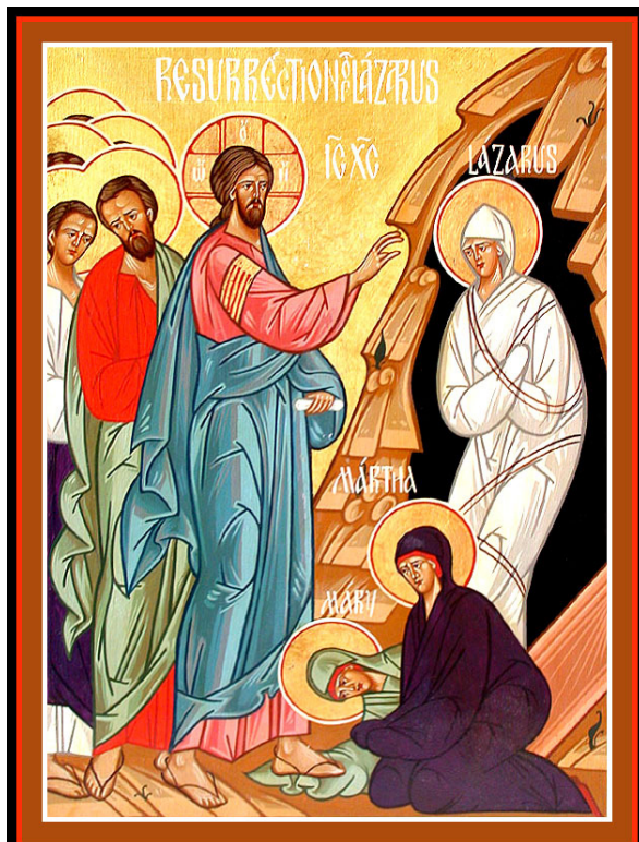
"The Raising of Lazarus" Icon

Tonight is the eve of All Saints Day, the festival in the Church that recalls the faith and witness of our brothers and sisters in Christ throughout all ages. The service celebrates our continuing communion with them, and memorializes the recently deceased. The early Church followed the Jewish custom that a new day began at sundown; thus, feasts and festivals in the Church were observed beginning on the night before. The night before All Saints (or All Hallows) became known as All Hallows Eve, and our Scripture readings tonight point to Jesus, who not only is the Light of the world, but is the Resurrection and the Life, triumphing over sin, evil, and death. Through faith in him we step from darkness into light, and from death into life.