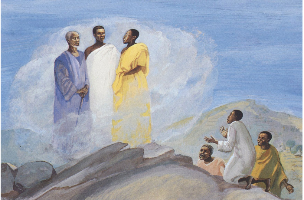
Jesus Mafa, Transfiguration , 1973.

Today, we celebrate the Transfiguration of the Lord, and with that celebration, we encounter two important points of convergence in our faith. First, we celebrate the Trinity as in the Gospel the Spirit is present in a cloud, God the Father speaks, and Jesus is proclaimed as his beloved Son. Second, the covenants of the Old and New Testaments come together, as Elijah and Moses speak with Jesus and the apostles Peter, James, and John are present to witness this moment of transfiguration. This powerful event ends as it began, as though nothing had happened, and Jesus cautions the apostles to say nothing until after his resurrection. So they return to their lives, holding this transfiguration in their minds and hearts.