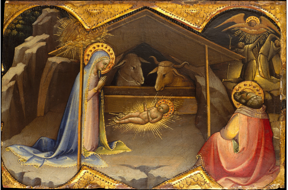
Lorenzo Monaco (Piero di Giovanni), The Nativity , ca. 1406–10.

Christmastide (named after the principal celebration of the “Christ Mass”) is the twelve-day festival during which Christians celebrate the birth of the Christ child in Bethlehem over 2,000 years ago. This vulnerable infant, long awaited and yet still a surprise, is the incarnation of God on earth. As we share gifts with our friends and families this season, we seek to capture the joy and wonder of the original gift of Christmas: Jesus Christ, coming into a broken world to dwell among us as the Son of God, our Savior.