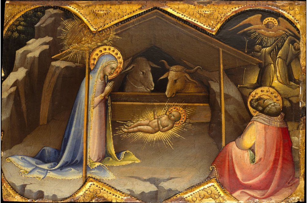
Lorenzo Monaco (Piero di Giovanni), The Nativity , ca. 1406–10.

In the ancient world, as nights grew longer, a celebration seemed in order when finally the sun seemed to push back against the long nights, and the days began to lengthen. In a symbolic parallel, the early followers of Jesus glimpsed this festival as an opportunity to celebrate the light of Christ shining through the world, enlightening human hearts and minds. Today, in the depths of our winter, as the days in the Northern Hemisphere grow longer, we celebrate that approaching light as God comes among us in the form of a tiny baby; come into the world to bring peace, love, joy, and hope. Glory to God in the highest!