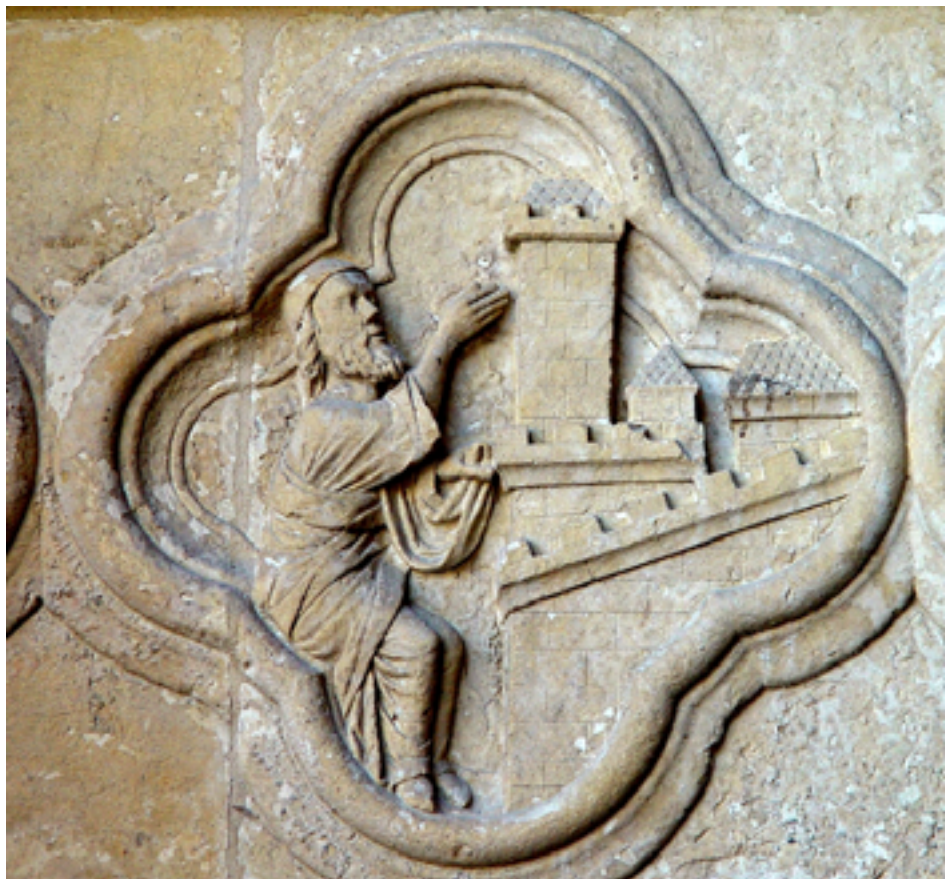
Isaiah Prophecy the Adoration of Christ , relief sculpture at Cathédrale d'Amiens Amiens, France, 1220–1240

The season of Advent is a time of waiting for the promises of God. The God who has drawn near to Israel will soon draw nearer still in the form of a baby. The scripture lessons emphasize the promises that are to be fulfilled. Isaiah foretells the birth of a child to be called Emmanuel, meaning “God with us.” The introduction to Paul’s Letter to the Romans reveals how Jesus was the fulfillment of God’s promise and opened the door of salvation to Gentiles as well as Jews. In Matthew’s Gospel, Joseph is visited in the night with the strange message of Jesus’s coming birth.