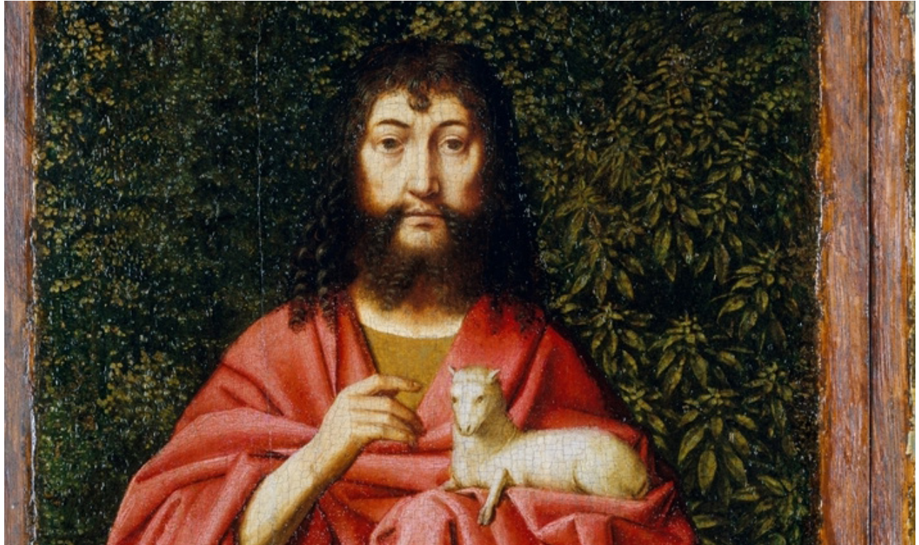
Detail, St. John the Baptist; Saint Francis Receiving the Stigmata Gerard David, c. 1485

In the third week of Advent, God's promises of new life and healing echo through the scriptures. In Isaiah, a new age is dawning—an age where the brokenhearted are comforted, the captives are freed, and where places of destruction and ruin are transformed into places of life through the power of God. In the Gospel of John, John the Baptist identifies himself as the voice in Isaiah who cries in the wilderness, “Make straight the way of the Lord,” with the promise that God is doing something new in the midst of his people.