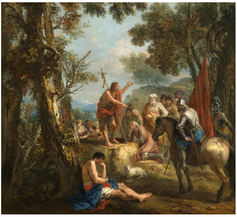
John the Baptist Preaching Francesco Zuccarelli, 1702–1788

Third Sunday of Advent Sunday, December 12, 2021, 11:00 a.m.