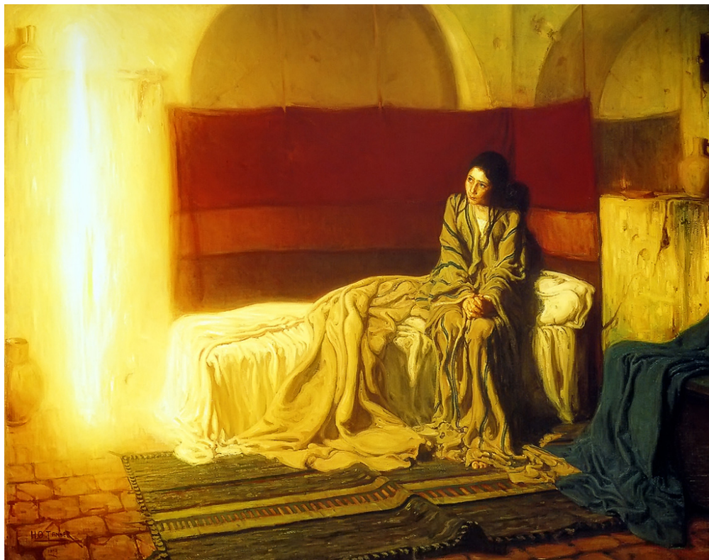
Henry Ossawa Tanner, Annunciation , 1898.

On this Third Sunday of Advent, we hear Mary's joyful song of praise—the Magnificat—as she extols God's goodness in choosing her for the greatest of purposes despite her lowly status. Her response reminds us of the importance of song in the life of faith. In his letter, James encourages his readers to be faithful as they patiently await the coming of the Lord, even through suffering and trial. Just as the farmer awaits the rain to produce the precious crop, so too James calls those to whom he writes to wait for the Lord, the coming Judge of the world.