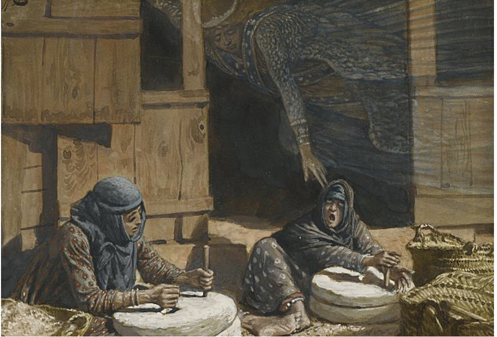
Two Women at the Mill James Tissot, c. 1886

Today we celebrate the first Sunday in Advent. Advent is Latin for “coming.” It celebrates the most important news about the past and the most important news about the future. Christ has come; and Christ is coming back. Just as the coming of Christ as a baby in Bethlehem took everyone by surprise, although it had long been predicted, so the coming of Christ in glory will no doubt take everyone by surprise, although it too has long been predicted. In Duke Chapel, we place a large wreath in the center aisle to represent the four Sundays of Advent and the central moment of Christmas. The first Sunday of Advent commemorates the longing of Israel for the Kingdom of God.