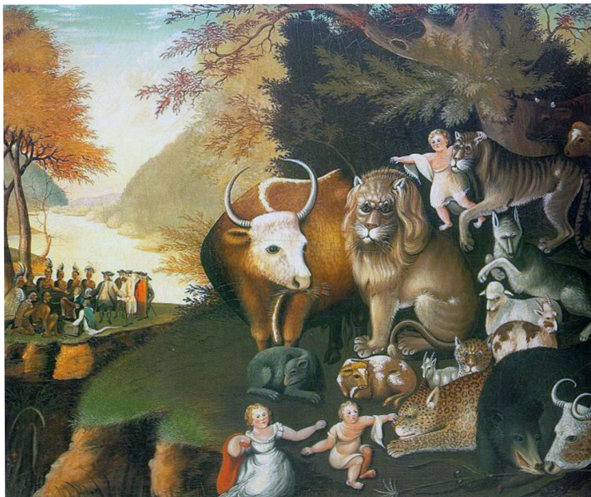
"Peaceable Kingdom," By Edward Hicks (1780–1849)

On this second Sunday of Advent, the Scripture readings prophesy both the first and second comings of the Messiah, Jesus Christ. The prophet Isaiah foretells the coming King from the root of Jesse, the father of King David, on whose throne our Savior Jesus will reign forever. In this peaceable Kingdom, divisions will cease, and children will come to no harm. In Matthew's Gospel, John the Baptist issues a fiery call for repentance, announcing the fulfillment of Isaiah's prophecy and the coming judgment that must precede the establishment of the Kingdom of God.