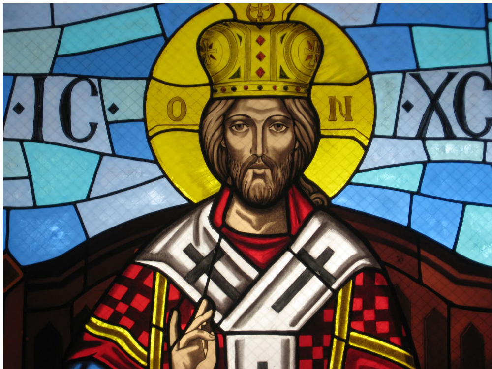
Christ the King , Stained glass window, Our Lady of the Annunciation Melkite Greek Catholic Cathedral, photo by John Stephen Dwyer, 2009.

In our world, the reign of a monarch is marked by a coronation, crowns, jewels of state, ceremonies, and great pomp and circumstance. Kingship brings to mind great privilege, wealth, and even power. However, our lessons for this celebration of Christ the King Sunday evoke a very different image—a view of God as a fierce but tender shepherd, guarding, guiding, and caring for the flock of the people of God, wherever they may be. In the Old Testament lesson, we are told God will seek the lost, bring back the strayed, bind the injured, and strengthen the weak. The epistle emphasizes Christ’s authority over all things, especially as head of the church, and the Gospel tells us that in the final judgement, Christ will call his cared-for flock of sheep to his side to inherit the kingdom.