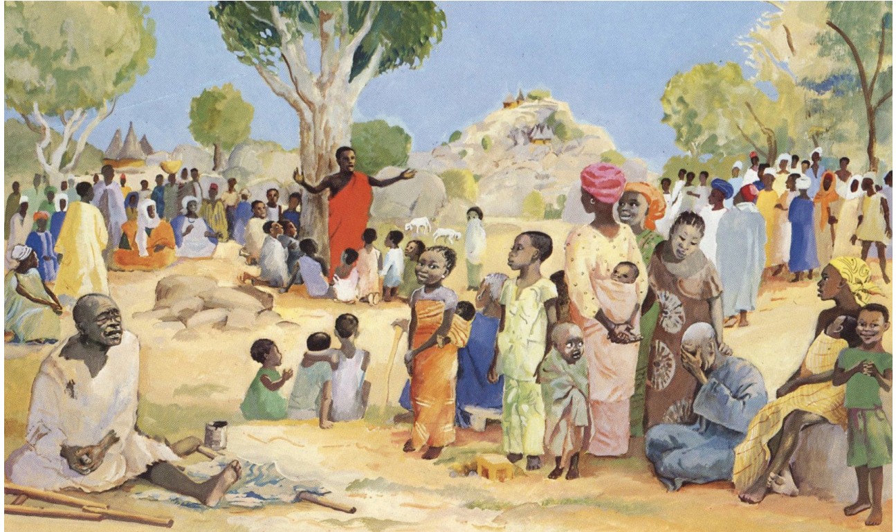
The Sermon on the Mount JESUS MAFA, Cameroon, 1973

Today is All Saints' Day, which is a time for the Church to remember all those saints, known and unknown, who have gone before us and have faithfully walked the path of righteousness. The scripture lessons speak to the love of God that conquers all things, even death. This love has captured saints through the ages, binding them to Christ and his kingdom. In the Gospel of Matthew, Jesus teaches his followers about who is blessed in the kingdom of heaven. Surprisingly, Jesus proclaims that those who seem cursed in this world are the very ones blessed in God's kingdom. Revelation provides an image of the church robed in white, standing in glory, by the grace of the blood of the Lamb. In this glorious scene, hunger and thirst, grief and hardship, suffering and pain will be no more. Only the worship of God will remain. In Romans, Paul declares that in the end nothing will separate us from from love of God in Christ Jesus.