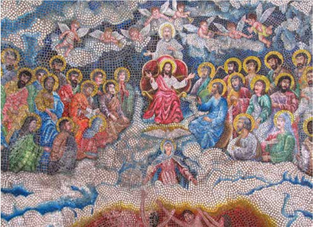
God with Angels and Saints , artist unknown, 1994. Detail of mosaic in St. John of Sahagun Parish, Tigbauan, The Philippines.

Tonight is the eve of All Saints' Day, the festival in the Church that recalls the faith and witness of our siblings in Christ throughout all ages. The service celebrates our continuing communion with them, and memorializes the recently deceased. The early Church followed the Jewish custom that a new day began at sundown; thus, feasts and festivals in the Church were observed beginning on the night before. The night before All Saints' (or All Hallows') became known as All Hallows' Eve, or Halloween. Our Scripture readings tonight point to Jesus, for it is by faith in him that we step from darkness into light, and from death into life.