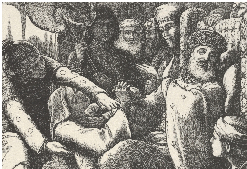
Unjust Judge and the Importunate Widow John Everett Millais, 1864

Nineteenth Sunday After Pentecost Sunday, October 20, 2019, 11:00 a.m.