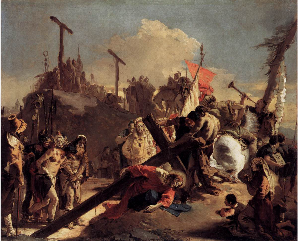
Giovanni Battista Tiepolo, Christ Carrying the Cross , c. 1738.

SERVICE OF WORSHIP Thirteenth Sunday After Pentecost Sunday, September 7, 2025, 11:00 a.m.