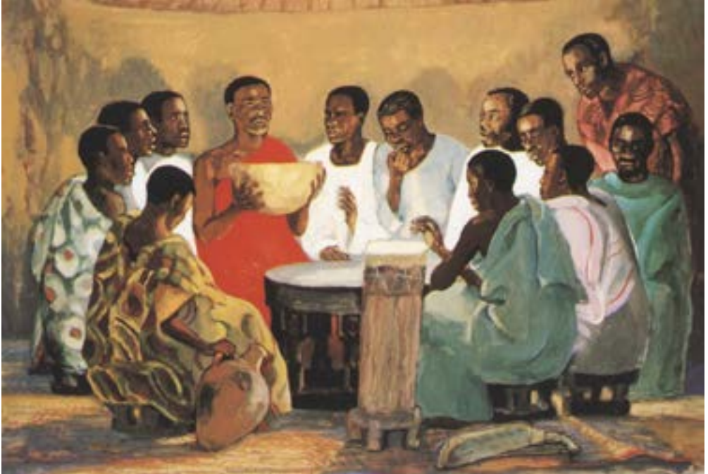
Jesus Mafa, The Last Supper , 1973.

SERVICE OF WORSHIP Eleventh Sunday after Pentecost Sunday, August 4, 2024, 11:00 a.m.