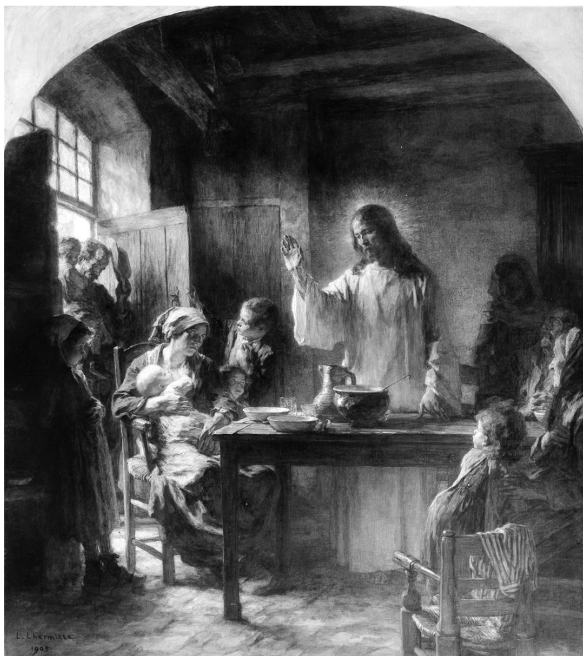
Léon Augustin Lhermitte, Among the Humble , 1905.

SERVICE OF WORSHIP Twelfth Sunday After Pentecost Opening Sunday Sunday, August 31, 2025, 11:00 a.m.