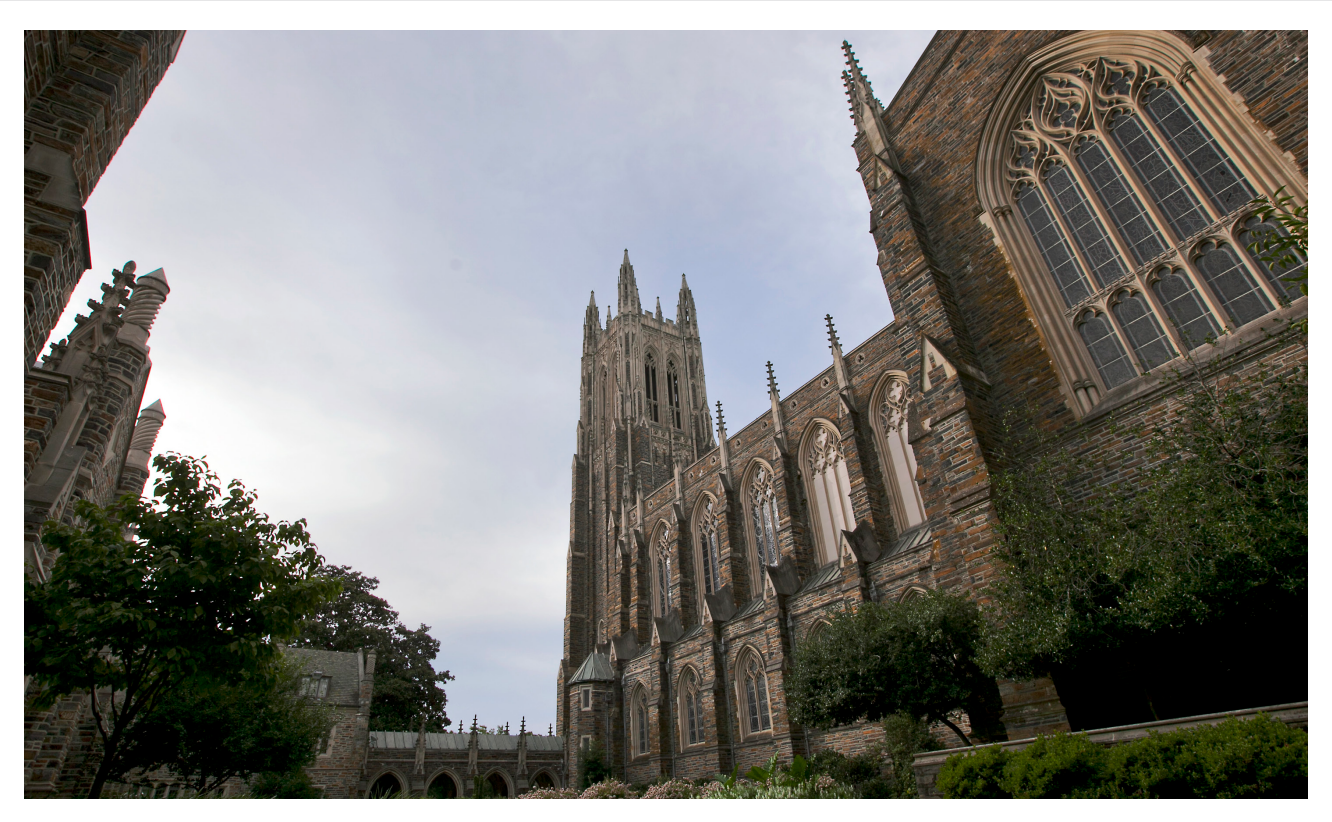
Chapel on a Summer Morning

Thirteenth Sunday after Pentecost Sunday, August 30, 2020, 11:00 a.m.