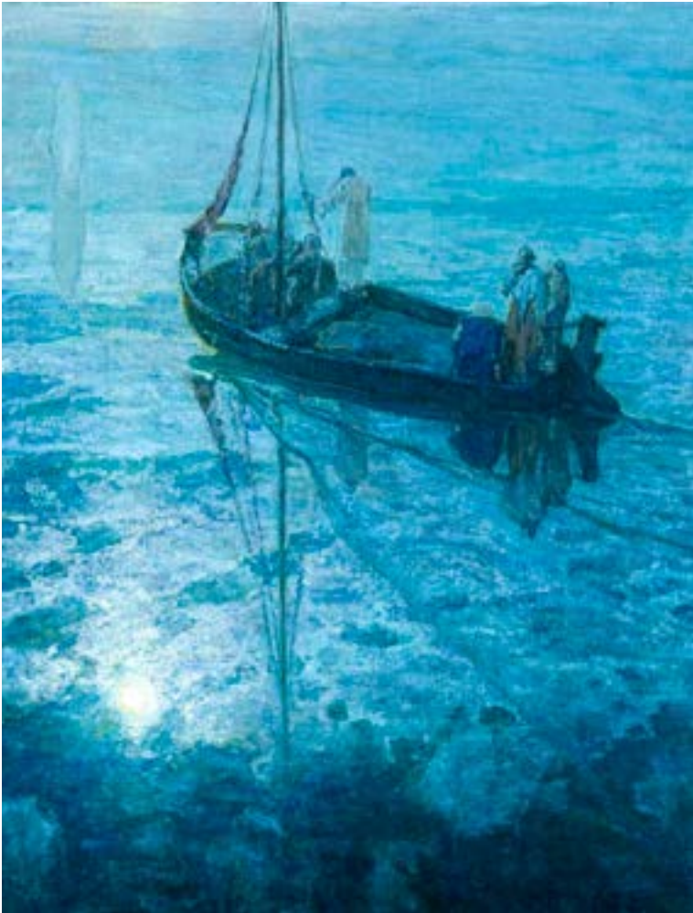
Disciples See Christ Walking on the Water , Henry Ossawa Tanner, 1859–1937.

SERVICE OF WORSHIP Eleventh Sunday after Pentecost Sunday, August 13, 11:00 a.m.