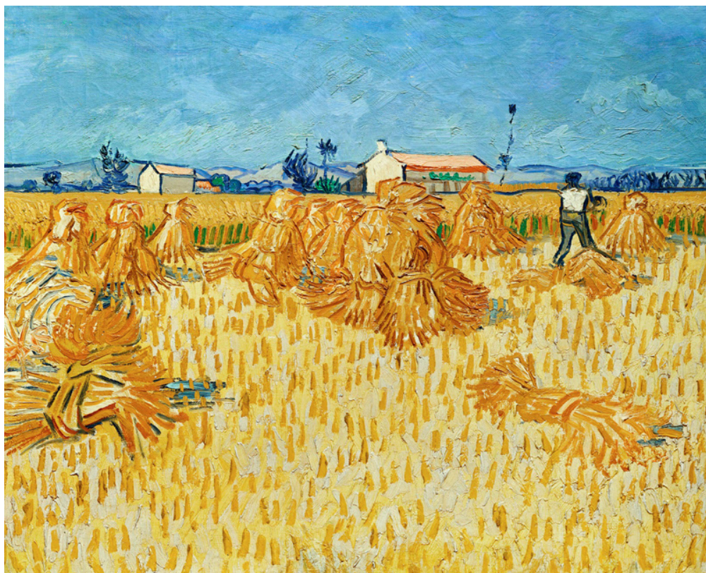
Vincent van Gogh, Harvest in Provence , 1888.

SERVICE OF WORSHIP Fourth Sunday After Pentecost Sunday, July 6, 2025, 11:00 a.m.