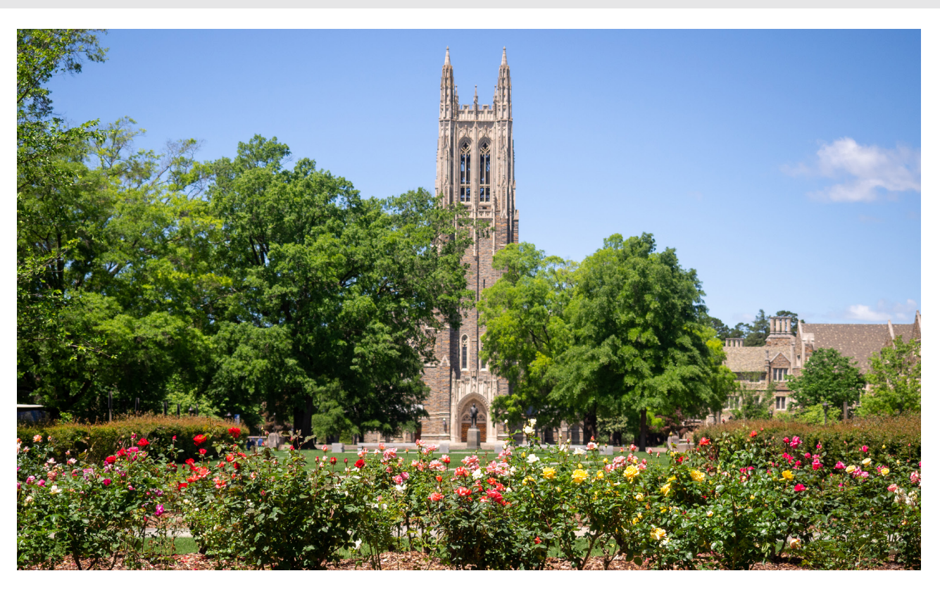
Duke Chapel in Spring

Third Sunday After Pentecost Sunday, June 21, 2020, 11:00 a.m.