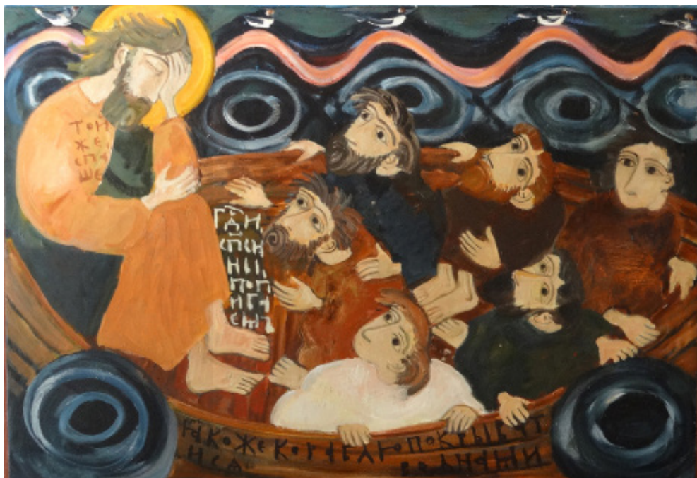
Christ Sleeping in the Storm