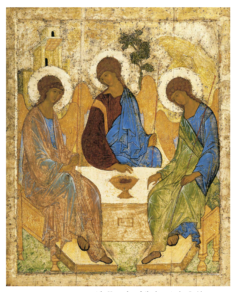
The Hospitality of Abraham, Andrei Rublev, c. 1411.

Trinity Sunday Sunday, June 4, 2023, 11:00 a.m.