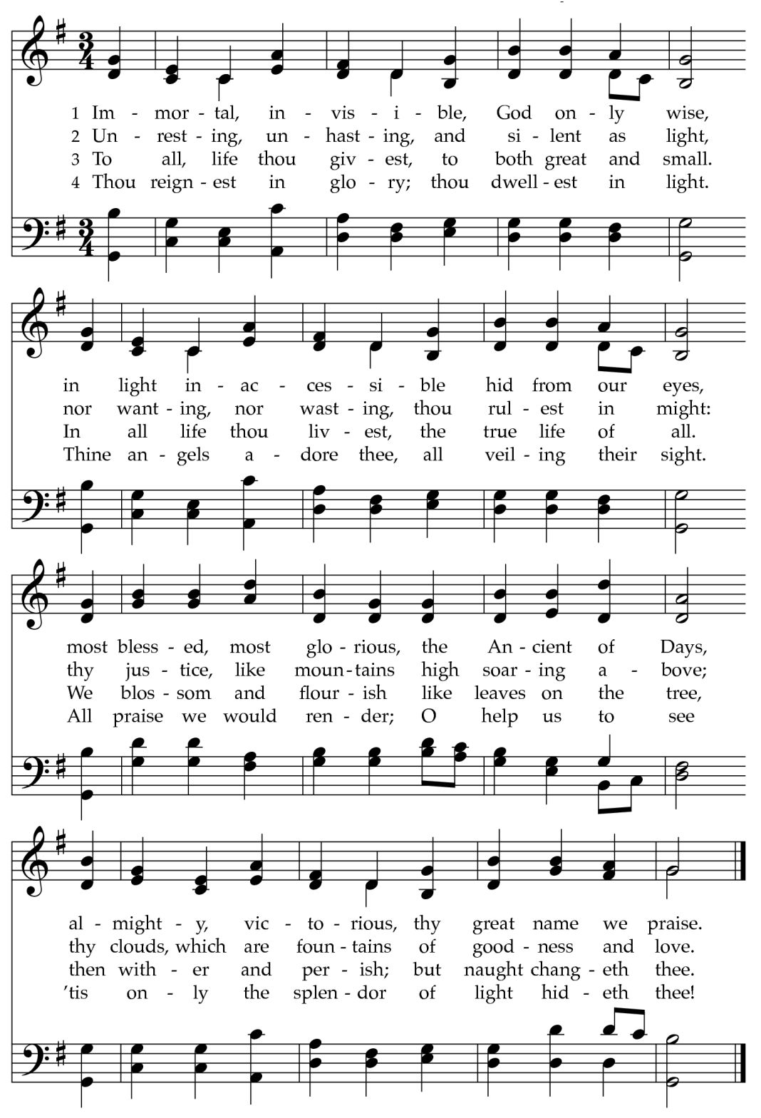
The opening line of this hymn was inspired by the three divine attributes listed in 1 Timothy 1:17 (King James Version), and it continues by considering how God's life exceeds our own finite existence. The text is well set to a Welsh melody shaped by many three-note units.