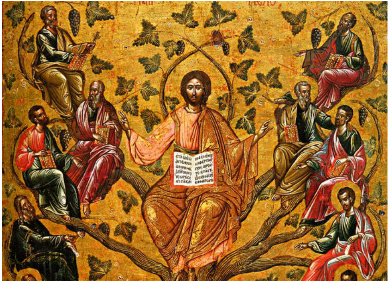
Eastern Orthodox icon of Jesus Christ as the True Vine Athens, Greece, c. 16th century

As we continue in Eastertide, the scriptures today call us to reflect on life abiding in the risen Christ. Jesus speaks to his disciples in the scripture passage from the gospel of John about fruitfulness. He uses the imagery of vines and branches to call his disciples to lives marked by the fruit of faithfulness. Jesus says that the Father is glorified when those who follow Christ bear much fruit. 1 John indicates that the most characteristic fruit of the Christian life is love. Any who abide in Christ love because God loved them first. Yet if any claim to love God but do not show the fruit of love for their sister or brother, 1 John says they are a liar. The story in Acts tells of Philip extending love beyond brothers and sisters to a person who was a stranger and foreigner. Philip followed God's prompting to share the good news of Jesus with the Ethiopian eunuch. In the end, Philip baptized the eunuch, leaving him rejoicing that he too abides in Christ.