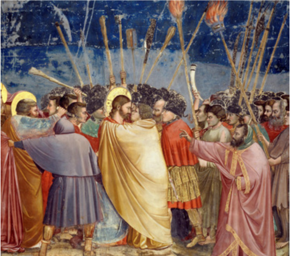
Giotto di Bondone, Kiss of Judas , 1304–1306.

On Good Friday, Christians recall the crucifixion and death of Jesus. Although Good Friday is one of the saddest days of the Christian year, the Church continues to call it “good,” believing that Christ’s suffering and death were not in vain but served to liberate humanity from sin and death. Scripture tells us that the earth went dark at the “sixth hour,” or noon. The service begins with a procession of the stations of the cross on the Chapel lawn followed by a simple, sparse service of scripture, preaching, and reflective music. We remember with deep sorrow the sacrificial suffering and death of an innocent man who is revealed to be the Son of God.