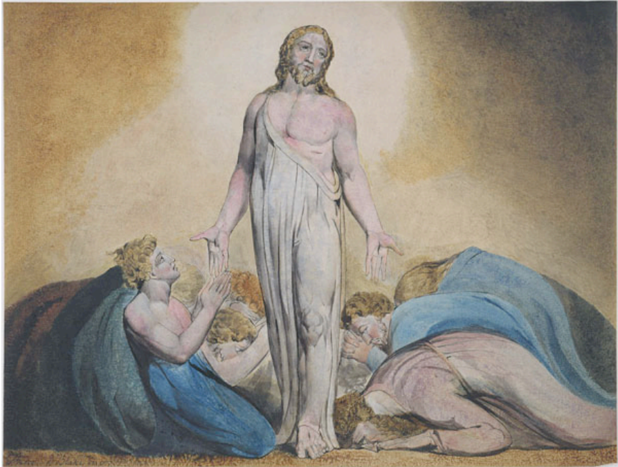
"Christ Appearing to His Disciples After the Resurrection," c. 1795, by William Blake.

How does the resurrection affect Christian identity and hope? The gospel lesson from Luke reveals the disciples' journey from fear and shock to joy and wonder at the presence of Jesus in their midst. Jesus shows his wounds and eats a lunch of broiled fish to emphasize this bodily resurrection—he is not a ghost, but the risen Lord. In 1 John, the author names the disciples as children of God, children of resurrection who wait with hope and assurance of Jesus' ongoing presence in their lives, even in the face of sin. This weekend Duke has been celebrating its alumni. The Chapel welcomes back many today who have cherished and shaped the history of worship and ministry in this place.