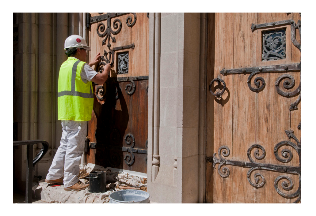
Renovating the doors of Duke University Chapel. Please continue to pray for the Chapel and all those working on its restoration.