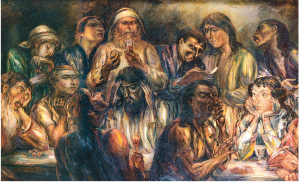
Károly Kernstok, Last Supper , 1921

Maundy Thursday marks the beginning of the climax of Holy Week, as Jesus shares his last meal with his friends before he is betrayed. The word “maundy” comes from the Latin word mandatum [ novum ], the first word of the Latin phrase meaning, “A new commandment I give unto you, that you love one another as I have loved you.” Jesus says this in John’s Gospel shortly after he washes the disciples’ feet. Maundy Thursday is also the night that Jesus instituted the Lord’s Supper with the words, “Do this in remembrance of me.” At the conclusion of the service, all worship articles and adornments are removed from the altar and chancel. This stripping symbolizes both the abandonment of Jesus by his disciples, and the stripping of Jesus by the soldiers before his crucifixion.