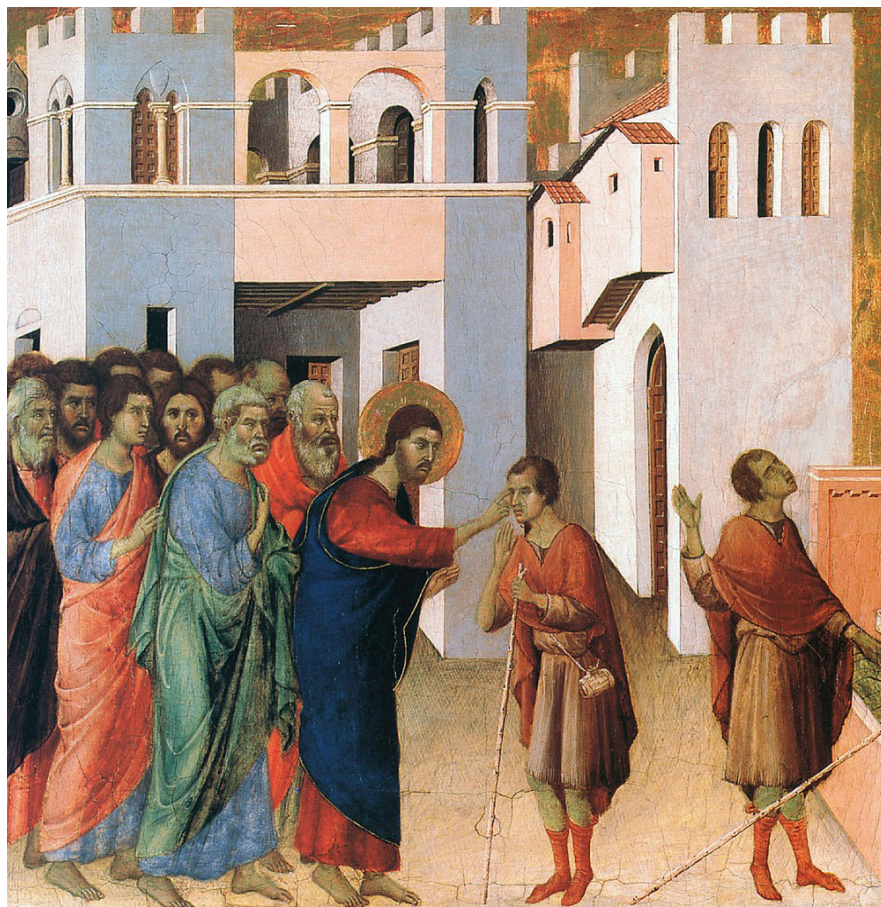
Healing of the Man Born Blind, Duccio di Buoninsegna, 1307

Laetare! This Latin word, meaning rejoice, is used by many Christian traditions to name this Sunday in Lent, often characterized by a brief lifting of the dark color of the season with a change from purple to rose. Surely a note of joy is also found in the lessons for today. The Old Testament lesson tells of Samuel chosen and anointed as the prophet of the Lord, the Psalm reassures us of the Good Shepherd's constant care, and we are reminded in the Epistle of the promise of resurrection. But what greater joy could be found than in the Gospel story of the man, blind since birth, healed by Christ and suddenly able to see the world around him? Laetare—rejoice in God!