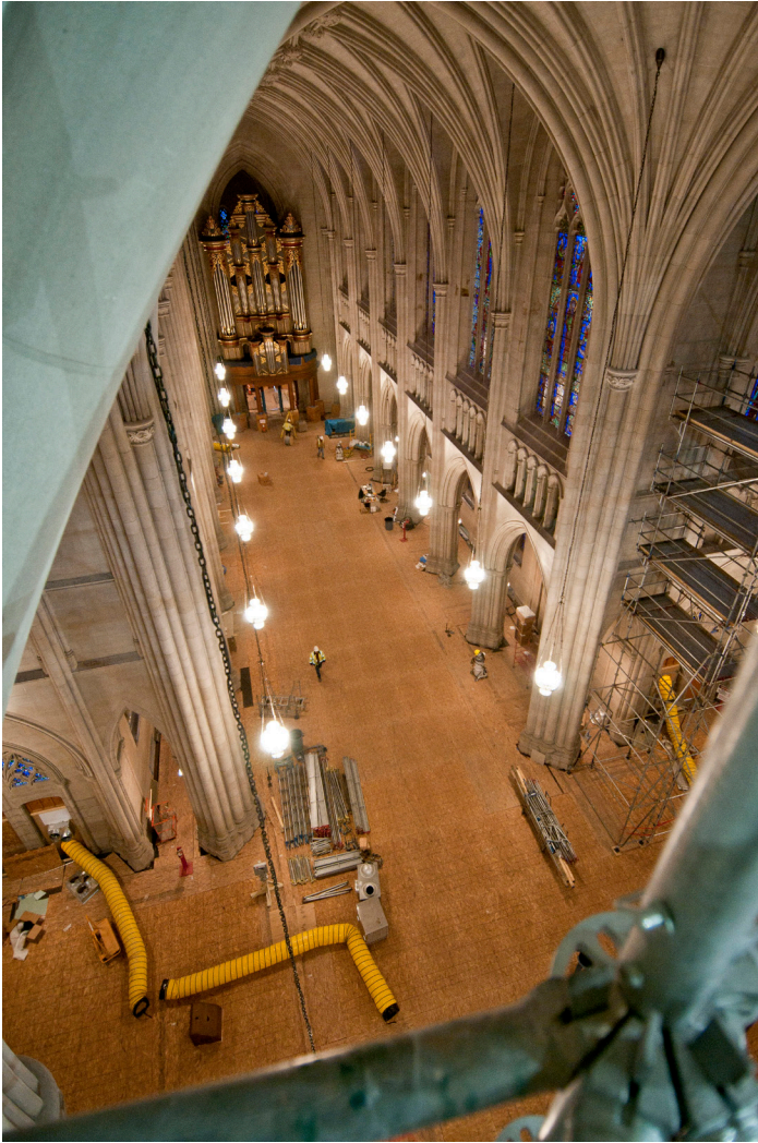
Renovation inside the nave of Duke University Chapel. Please continue to pray for the Chapel and all those working on its restoration.