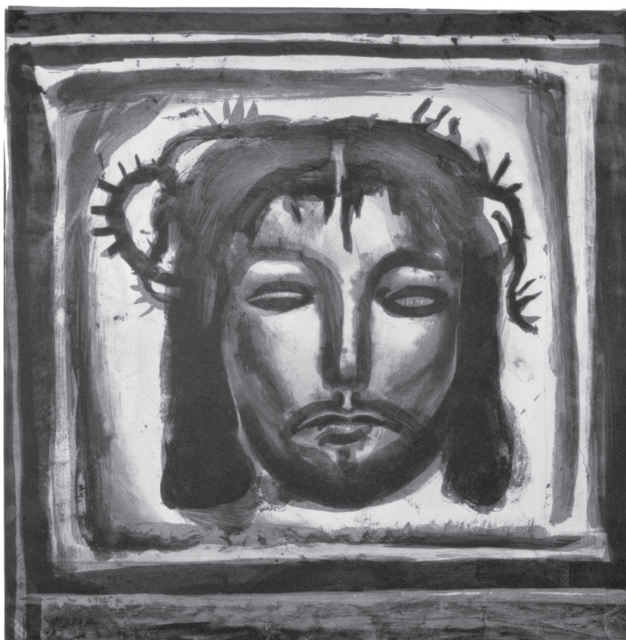
Georges Rouault, "Veronica, With Her Soft Linen, Still Walks The Road..." from the Miserere series, 1948.

In today's Gospel passage, Jesus encounters a Samaritan woman at a well. In a series of exchanges, Jesus breaks down cultural barriers in order to speak to her heart. He offers her the gift of living water that will restore her soul, found only through faith in him. This echoes God's miraculous provision of water to the Israelites in the wilderness many centuries before, as we too are invited to partake in Jesus' new covenant of eternal life.