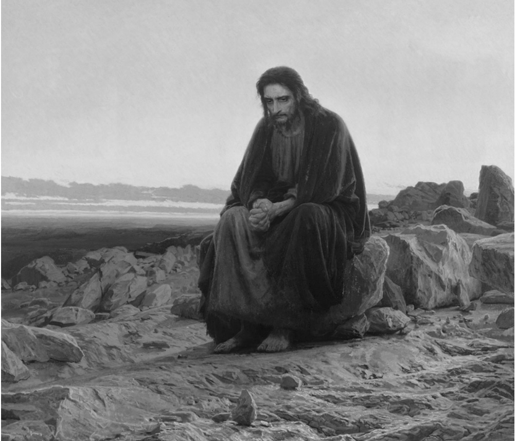
Ivan Nikolaevich Kramskoï, Christ in the Wilderness

Lent begins by presenting us with two temptations—the first temptation of Adam in the garden and the later temptation of Jesus in the wilderness. The New Testament lesson is used as a fulcrum to balance these stories and emphasize that through Adam’s yielding to temptation, sin was introduced to the world, bringing death and condemnation to all. Christ’s response in the desert—the rejection of temptation and his fundamental response of righteousness—brings triumph over sin, a “free gift” to all, and liberation from the death that follows sin.