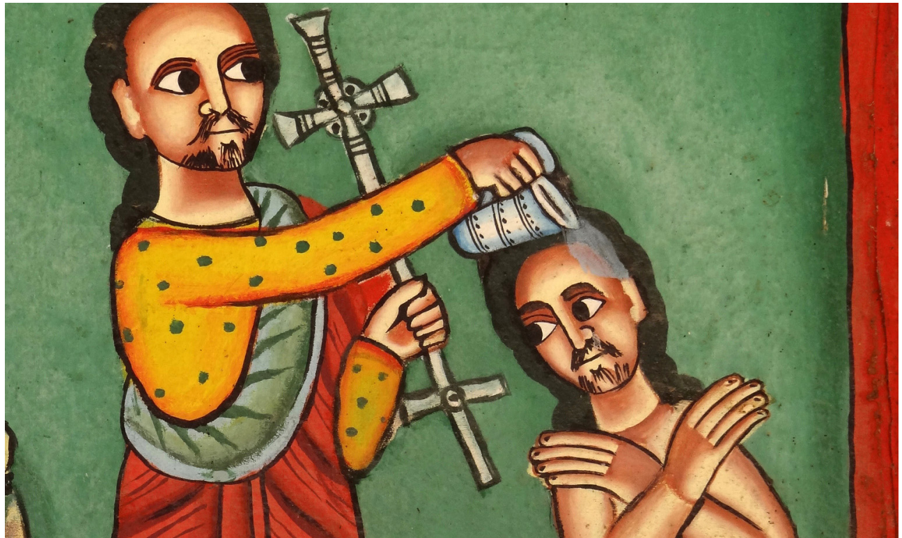
Detail, John Baptizing Jesus Mural, Church of Enda Yesus, Ethiopia

Today we celebrate the Baptism of Jesus. In the Gospel of Mark, John the Baptist proclaims a baptism of repentance for the forgiveness of sins and announces the coming of Christ, who will baptize with the Holy Spirit. In an act of humble obedience, Jesus, the sinless one, is baptized by John. As Jesus rises up from the water, the heavens are opened and the Spirit descends on him as a voice from heaven declares, “You are my Son, the Beloved; with you I am well pleased.” This public proclamation of Christ’s identity is an epiphany—like the adoration of the magi after Jesus’s birth—through which God’s glory is revealed to the world. We also give thanks today for the gift of our own baptisms, by which we are cleansed of sin, claimed as God’s beloved children, and made siblings in Christ.