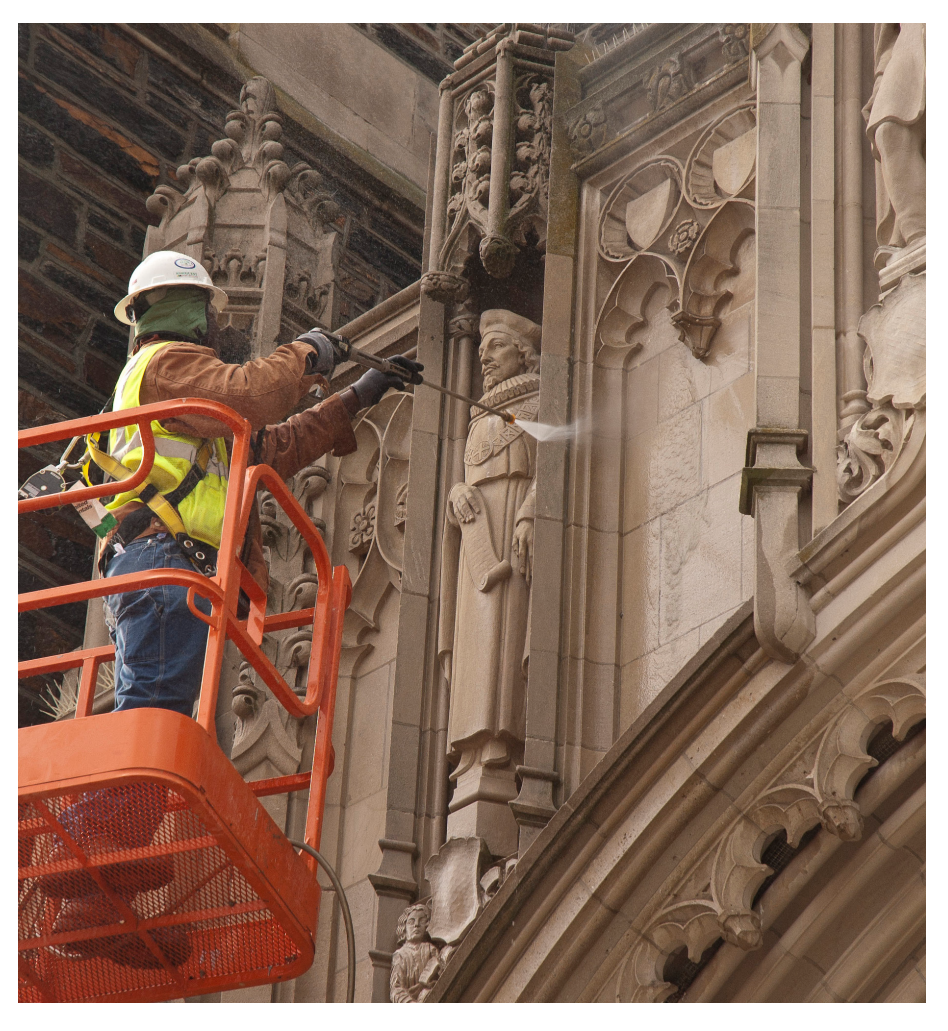
Limestone entry cleaning. Please continue to pray for the Chapel and all those working on its restoration.

Offering—Next week's offering will go towards the Chapel's Mission of the Month.