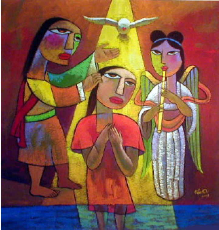
"Baptism," by He Qi, 2003.

~ Keeping the heart of the University listening to the heart of God ~