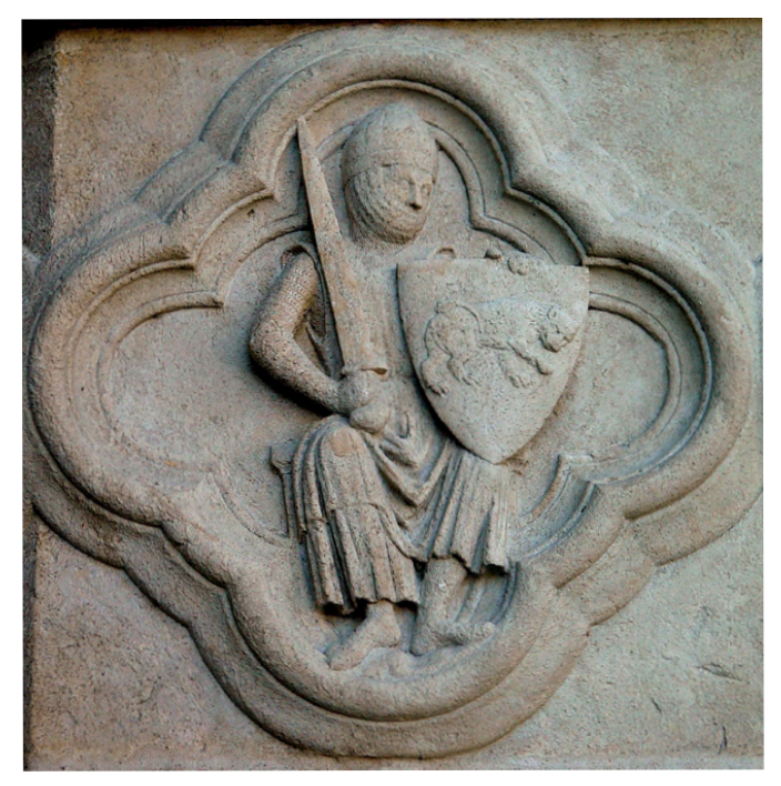
Personification of Fortitude, Quatrefoil on the exterior of Cathédrale d'Amiens, c. 1230

Ninth Sunday after Pentecost Sunday, July 22, 2018, 11:00 a.m.