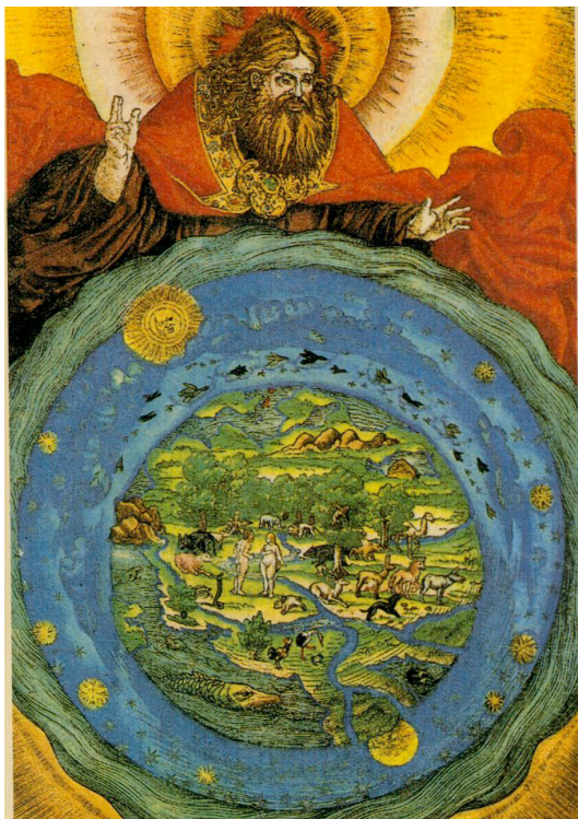
"Creation," by Lucas Cranach the Elder, 1534.

~ Keeping the heart of the University listening to the heart of God ~