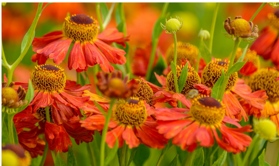
"Fading Flowers," via Pixabay

The first and second Advents of Christ fulfill many prophecies of the Old Testament Scriptures. In Mark's Gospel, John the Baptist preaches a baptism of repentance for the forgiveness of sins, proclaiming the One who will baptize with fire and the Holy Spirit. John quotes the prophet Isaiah, calling all creation to prepare itself for Jesus' coming, for "the grass withers, the flower fades; but the word of our God will stand for ever."