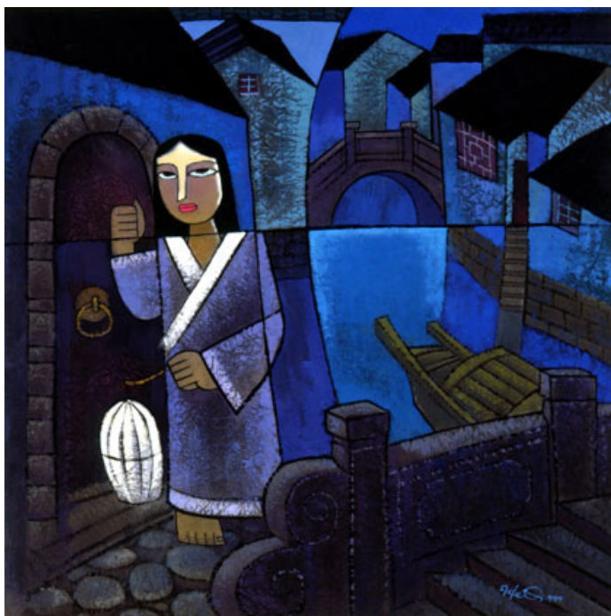
"Knocking at the Door," by He Qi, 2001

Today we enter the season of Advent and the beginning of the church's liturgical year. Advent is the time we anticipate the coming of our Savior, Jesus Christ, both as the incarnate Christ-child and his future coming to reign in glory in the consummated Kingdom of God. In today's Gospel reading, Jesus teaches about the fearsome majesty of his second coming, urging us to remain watchful, so that "when you see these things taking place, you know that he is near."