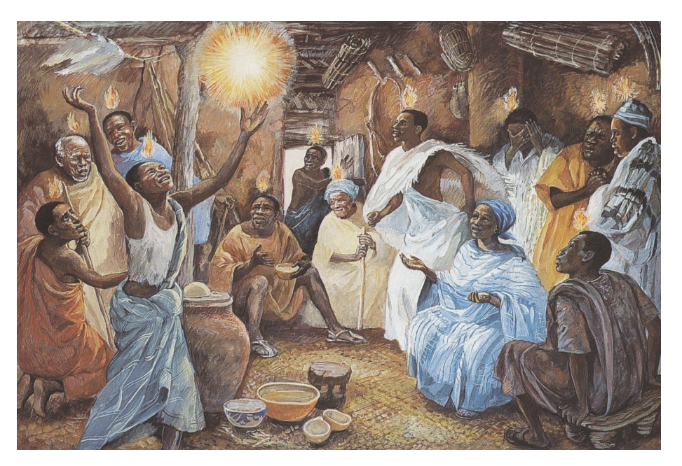
"Pentecost," by the Jesus MAFA Community, Cameroon

Fifty days after Easter, the Church celebrates the festival of Pentecost. Echoing the ancient Jewish festival of Shavuot, which remembers God's giving of the law on Mount Sinai, Pentecost celebrates God's giving of the Holy Spirit, itself a fulfillment of ancient prophecy. In our Scripture readings, the disciples are gathered in Jerusalem when the Holy Spirit descends upon them in tongues of flame. The disciples are given miraculous ability to speak in many languages, and boldly proclaim to the people that everyone who calls on the name of the Lord Jesus shall be saved.