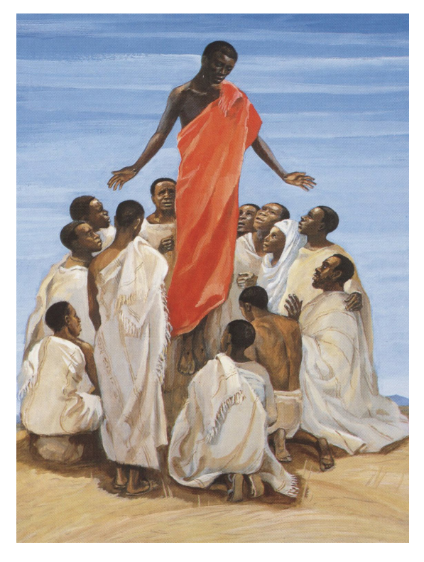
"The Ascension," by the Jesus MAFA Community, Cameroon

Forty days after Easter, the Church celebrates the Ascension of Jesus as described in Acts, Luke, and Mark. Today we mark this celebration. The Church holds that the day of Ascension is a day for celebration because all the work that Jesus came to do has been accomplished, and he returns to the right hand of God the Father. In today's Scripture readings, Jesus declares that he is the long-awaited Messiah, and calls his disciples to proclaim that he is the only way to the one true God.