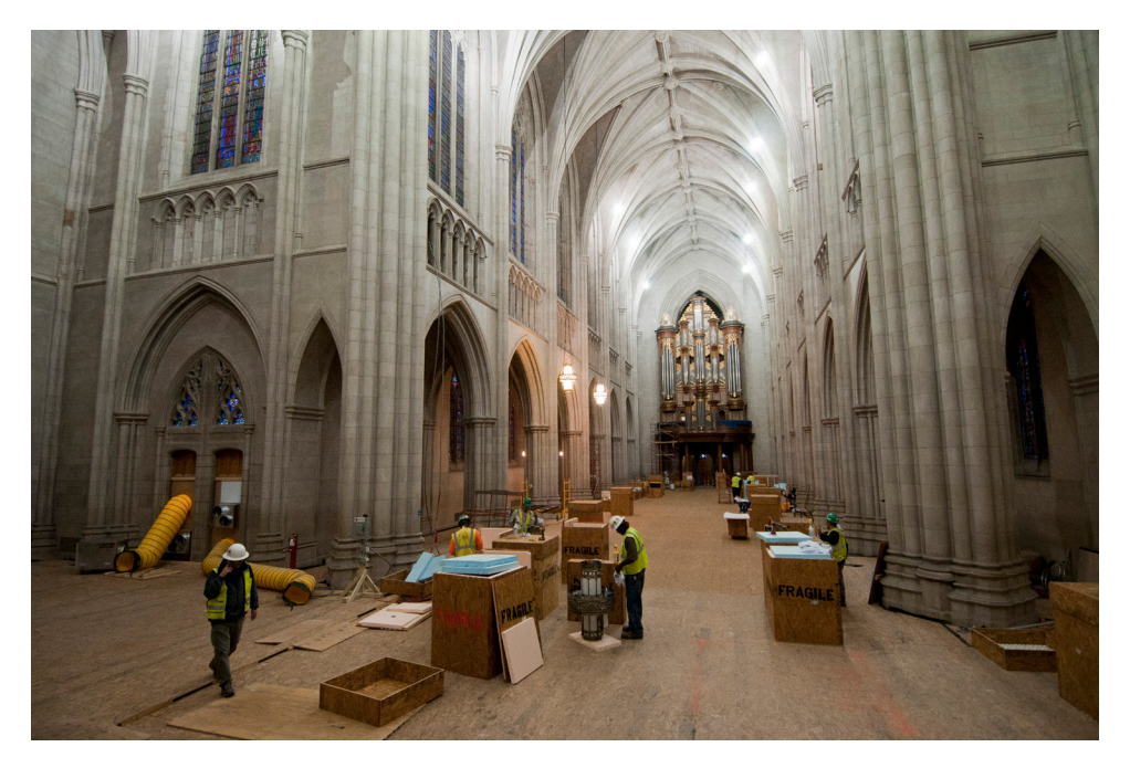
Getting the chandeliers cleaned, re-lamped, and ready to re-hang inside Duke University Chapel.

Please continue to pray for the Chapel and all those working on its restoration.