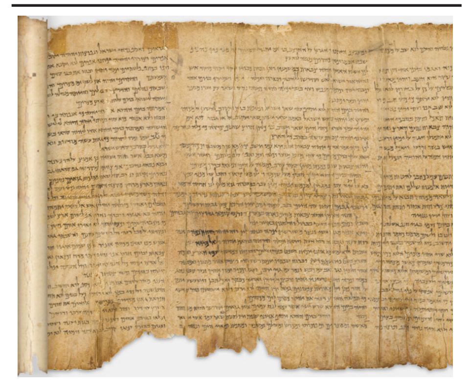
"The Great Isaiah Scroll,", ca. 200 B.C.

In this morning's Scripture passage from Nehemiah, Ezra leads the restored Israelite people in a reading of the Law, and a recommitting to the Lord's faithful covenant. In Luke's Gospel, we see Jesus make an astonishing declaration as he similarly reads the Scriptures before the people. Jesus reveals that he is the living fulfilment of Isaiah's prophecy that God would establish a Kingdom of justice and righteousness. The Holy Spirit rests upon Jesus, and in Paul's letter to the Corinthians, we see the promise of the Spirit shared with all believers. Each member of the Church will be equipped with the gifts necessary to unite the living body of Christ and usher in the coming Kingdom of God.