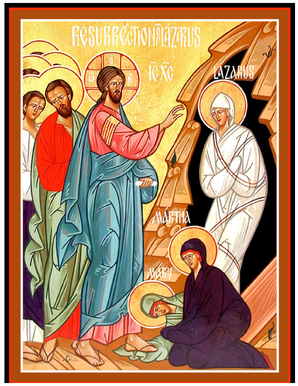
"The Raising of Lazarus" Icon

Tonight is the eve of All Saints Day, the festival in the Church that recalls the faith and witness of our brothers and sisters in Christ throughout all ages. The service celebrates our continuing communion with them, and memorializes the recently deceased. The early Church followed the Jewish custom that a new day began at sundown; thus, feasts and festivals in the Church were observed beginning on the night before. The night before All Saints (or All Hallows) became known as All Hallows Eve, and our Scripture readings tonight point to Jesus, who not only is the Light of the world, but is the Resurrection and the Life, triumphing over sin, evil, and death. Through faith in him we step from darkness into light, and from death into life.